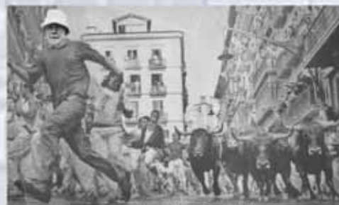
"Running with the Bull"