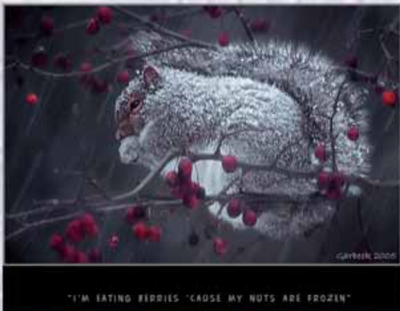
"I'M EATING BERRIES 'CAUSE MY NUTS ARE FROZEN"