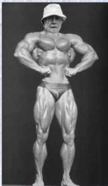
I got thee nines