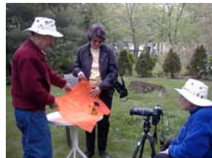
Can't photograph with an empty stomach