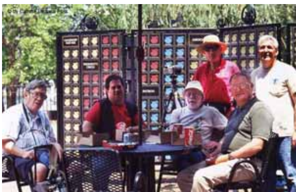
The Art Director