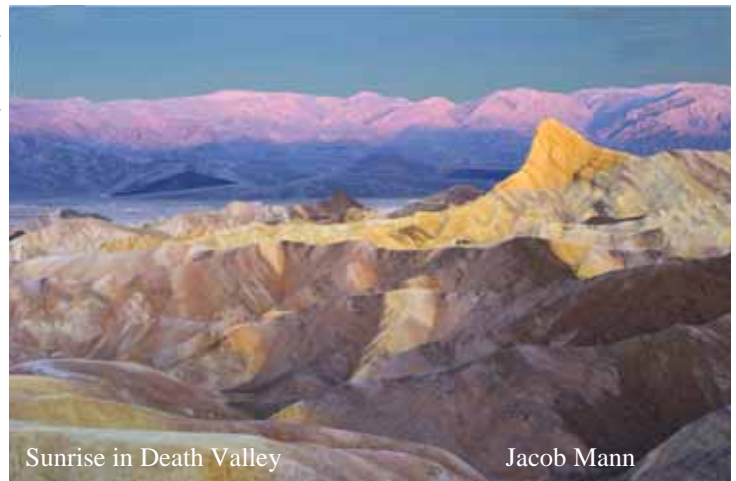
Sunrise in Death Valley