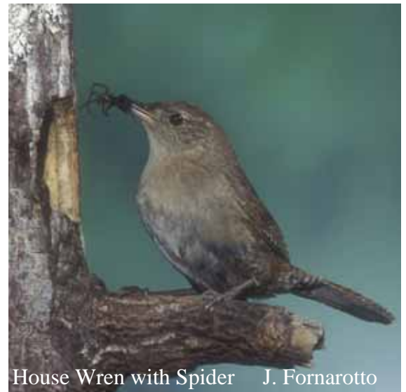
House Wren with Spider