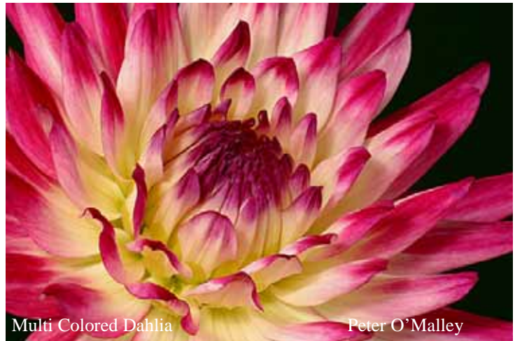
Multi Colored Dahlia