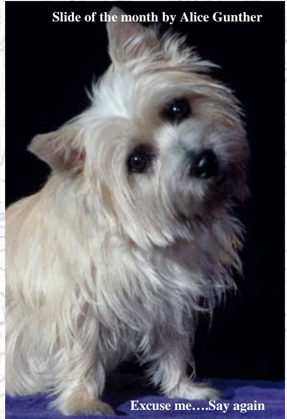
Excuse me....Say again