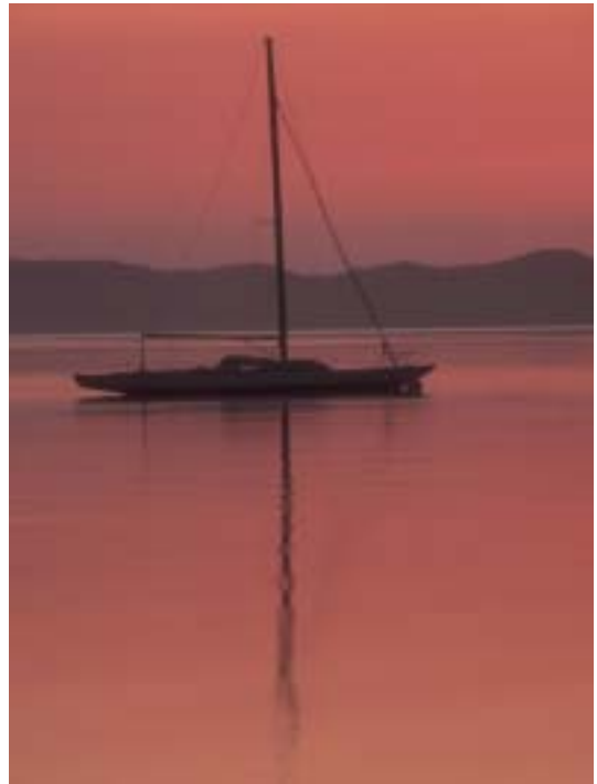
Sailboat at Sunset