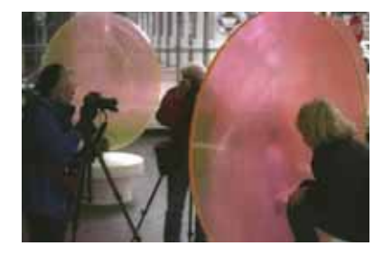
photo ops to be found. We had the most fun with some reflecting surfaces on Water Street and some large movable plastic disks.

After lunch things started to look up we explored the Fish market area along the river up to the Brooklyn Bridge. The light did get better and there are numerous