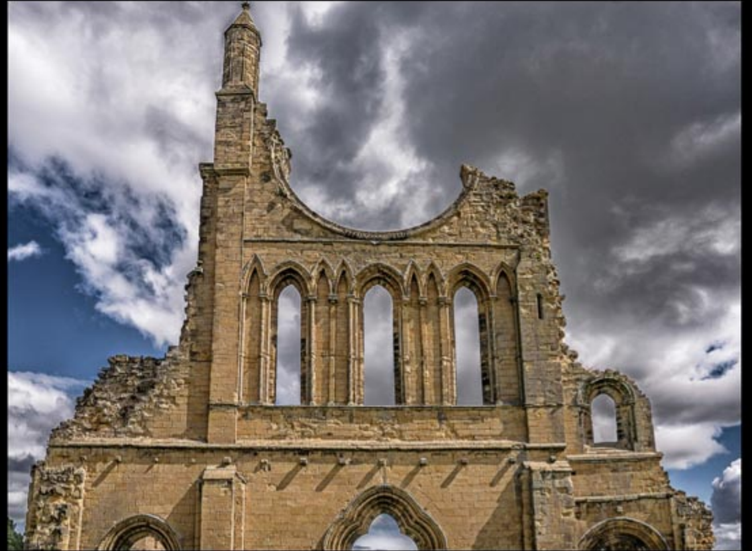
Thomas Girtin (1775-1802) - Byland Abbey