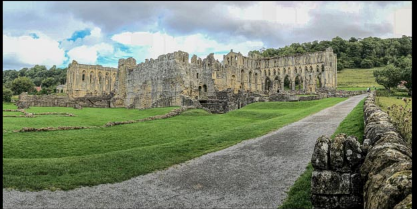
JMW Turner (1775-1851) - Rievaulx Abbey