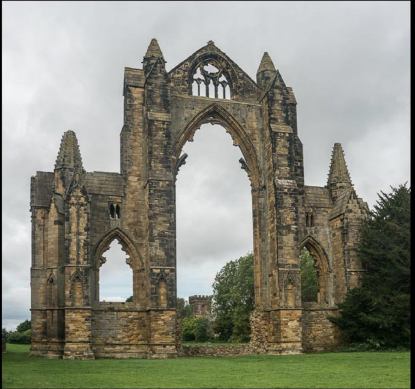
Thomas Girtin (1775-1802) - Guisborough Priory