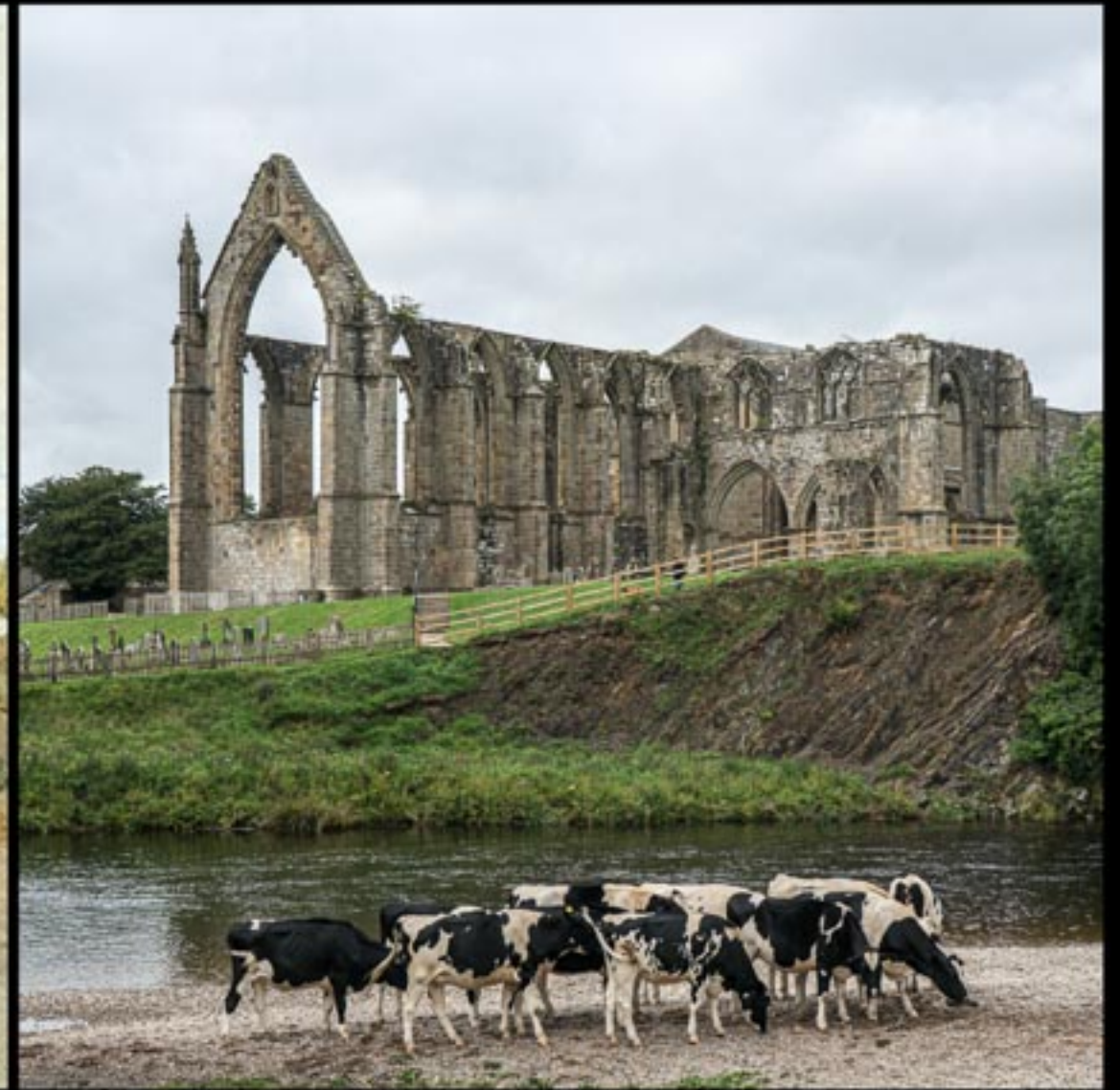
Thomas Girtin (1775-1802) - Bolton Priory