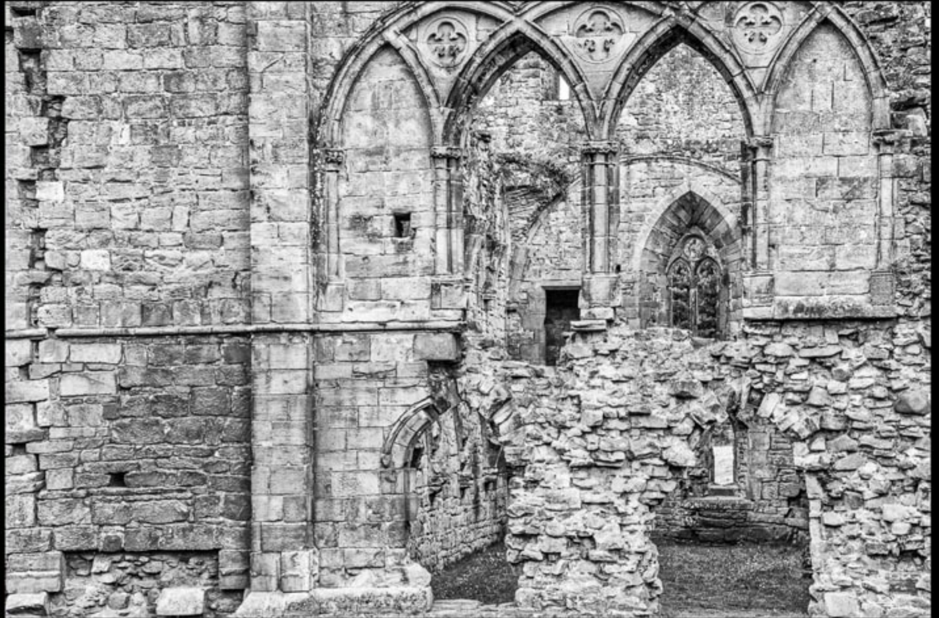
JS Cotman (1782-1842) - Easby Abbey