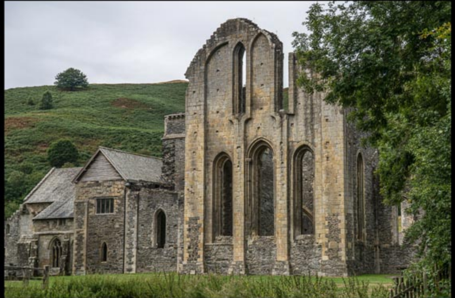
Richard Wilson (1714-1782) - Valle Crucis Abbey