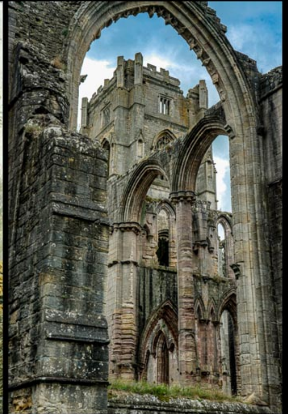
Francis Nicholson (1753-1844) - Fountains Abbey