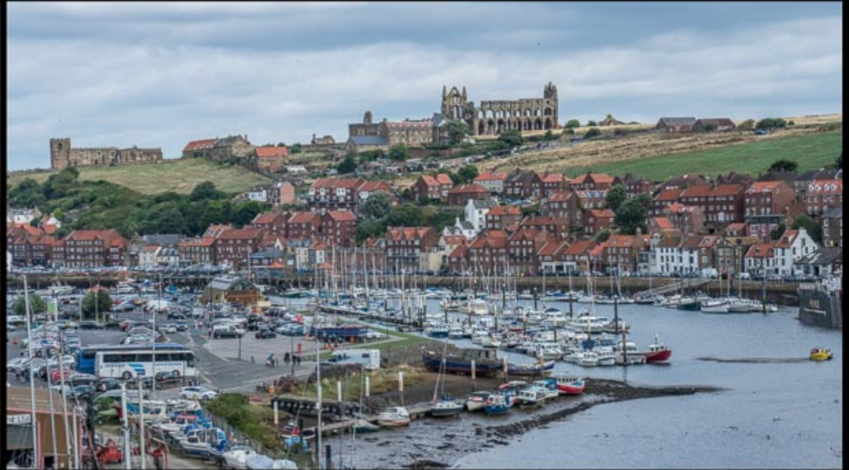
JMW Turner (1775-1851) - Whitby Abbey