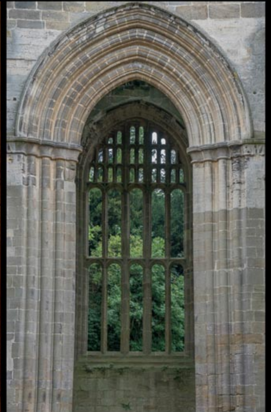
JMW Turner (1775-1851) - Fountains Abbey