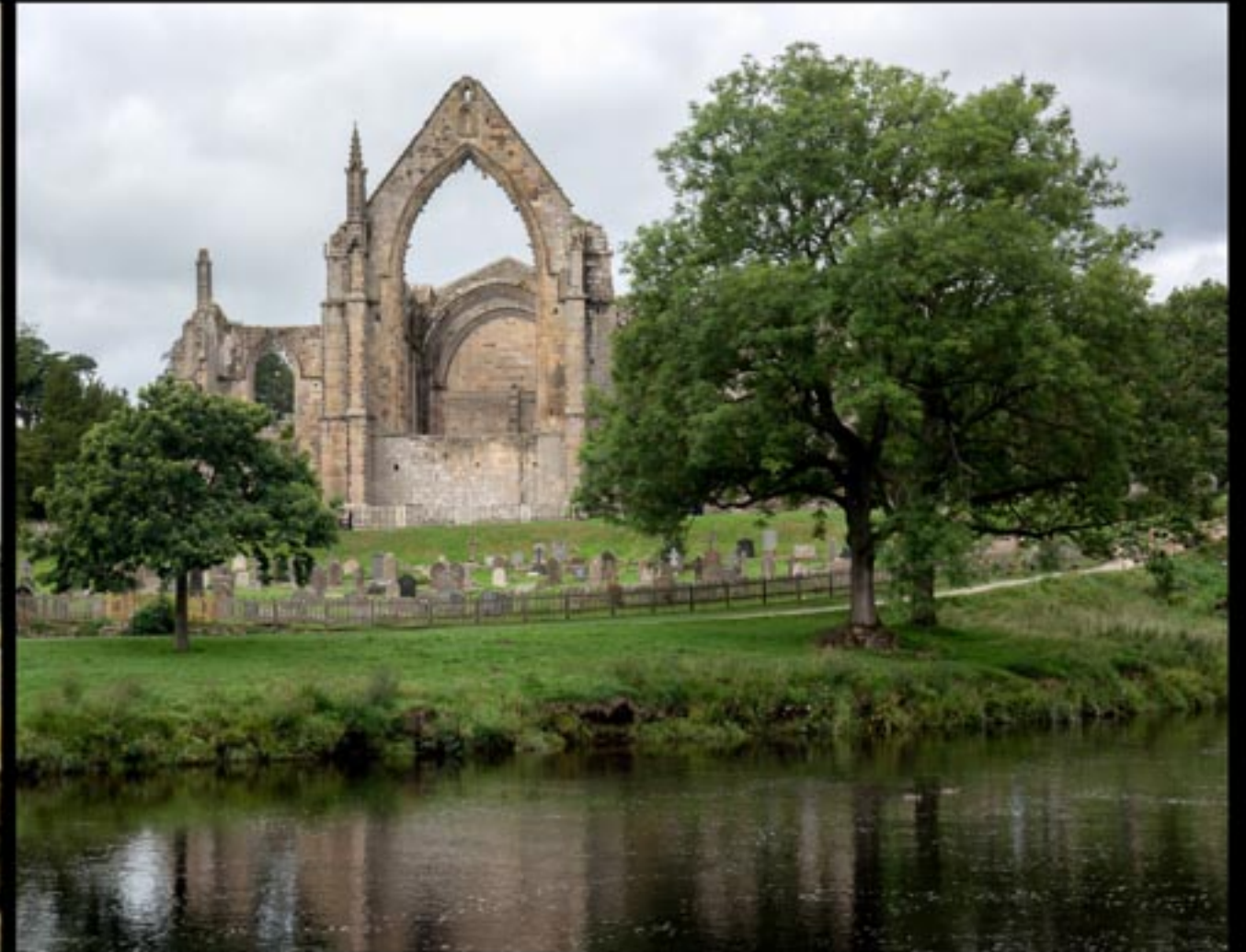
JMW Turner (1775-1851) - Bolton Priory