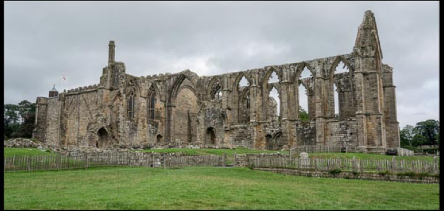
JS Cotman (1782-1842) - Bolton Priory