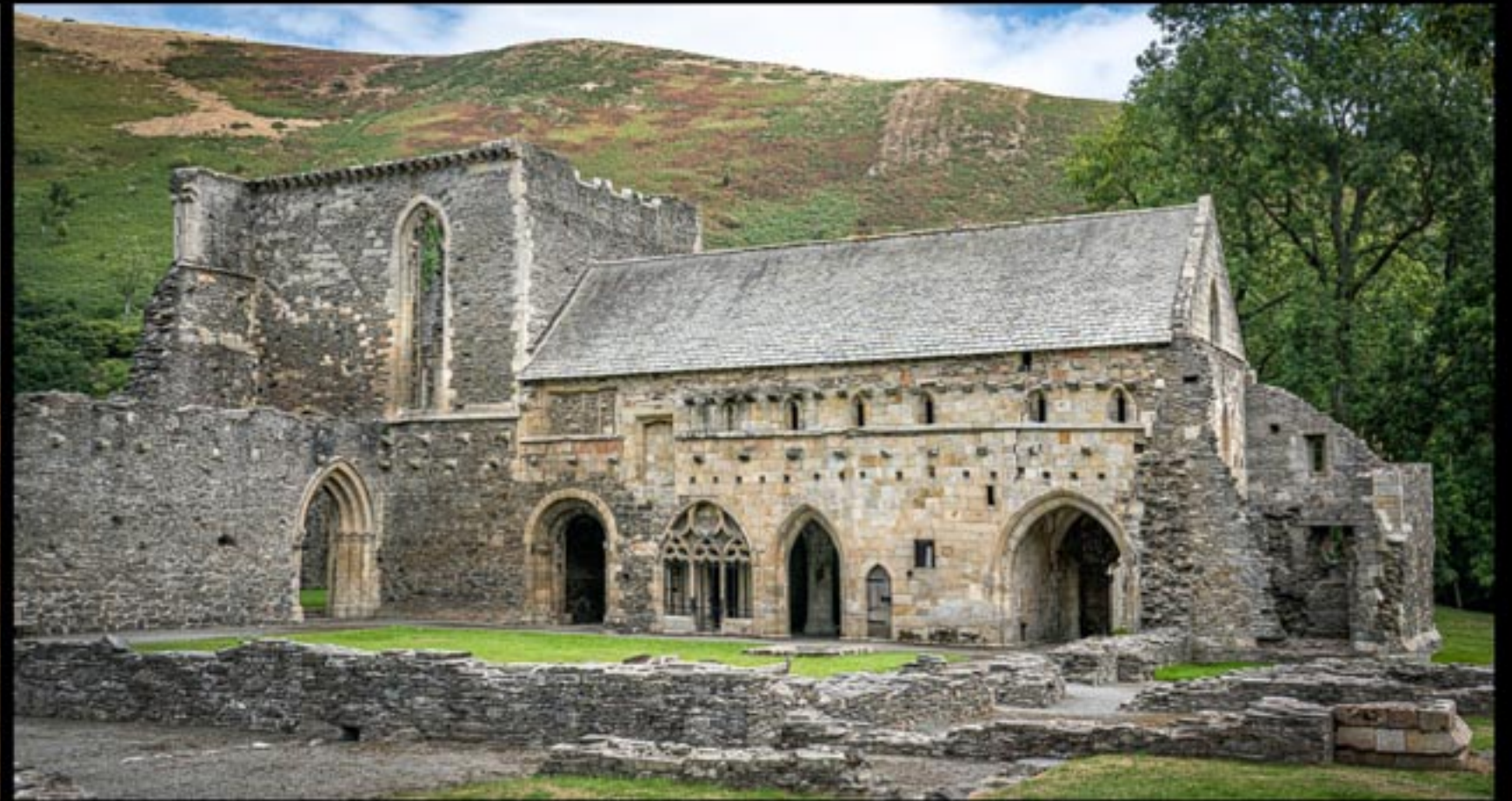
Thomas Girtin (1775-1802) - Valle Crucis Abbey