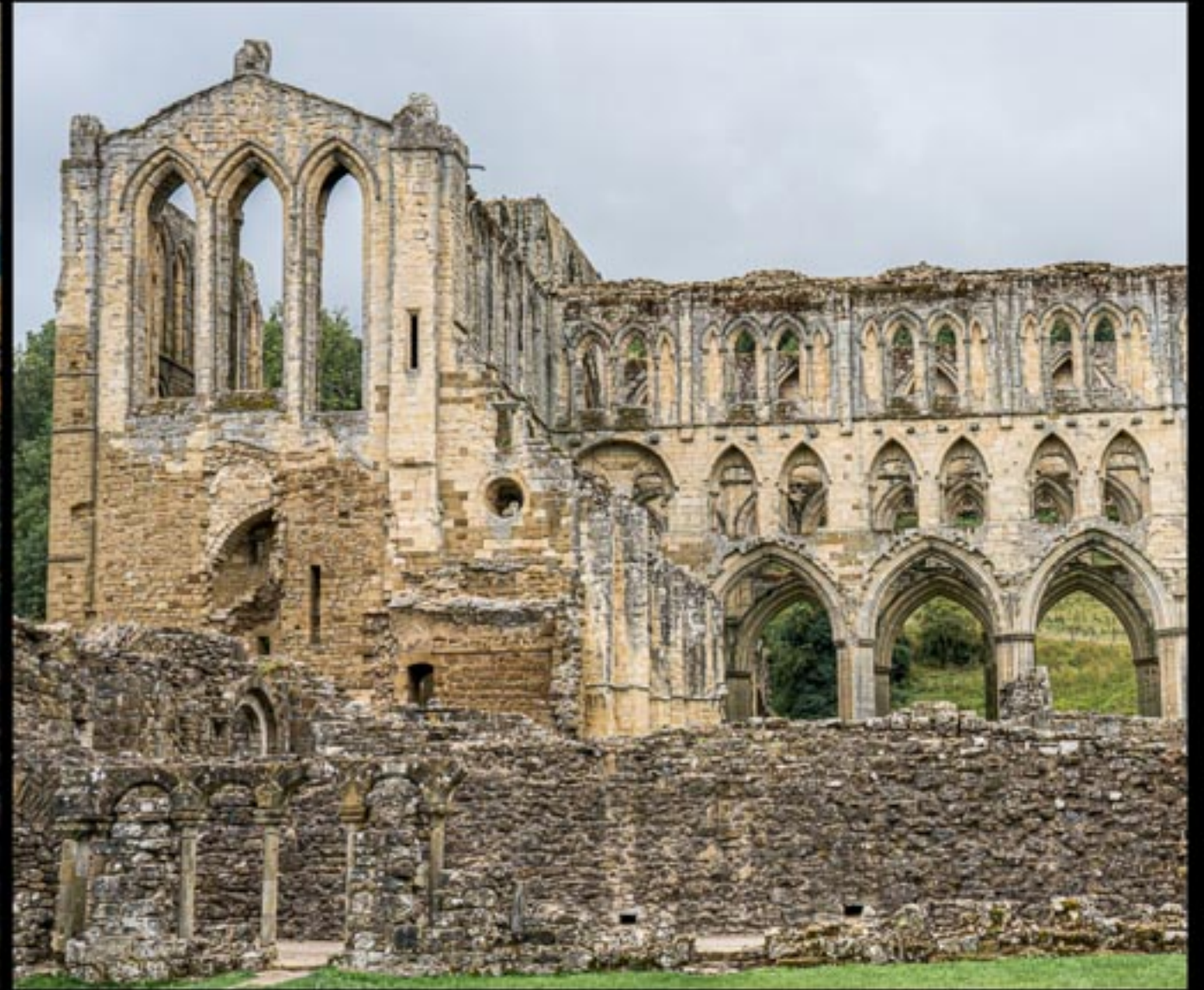
Thomas Girtin (1775-1802) - Rievaulx Abbey