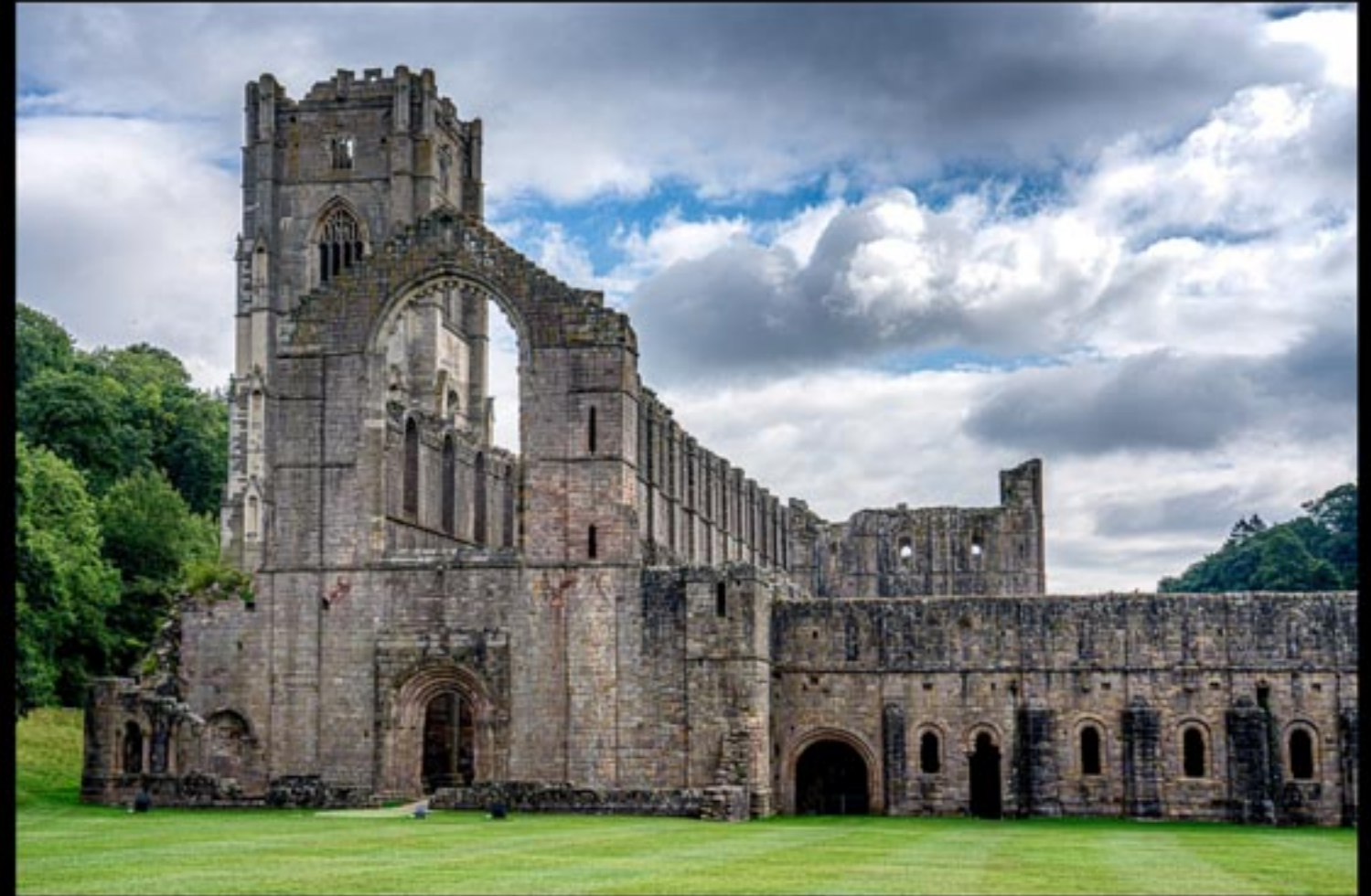
JC Ibbetson (1759-1817) - Fountains Abbey