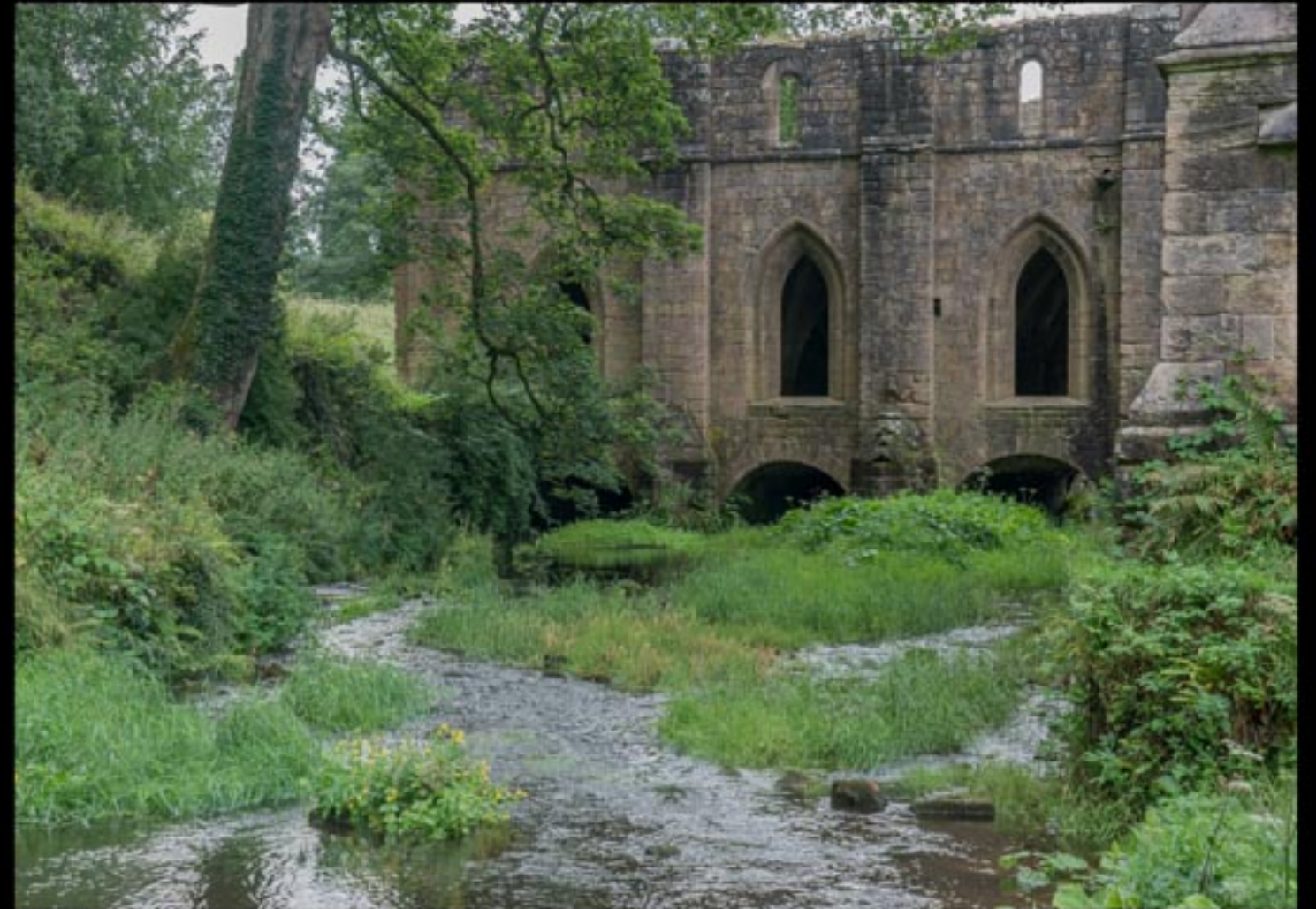
JMW Turner (1775-1851) - Fountains Abbey