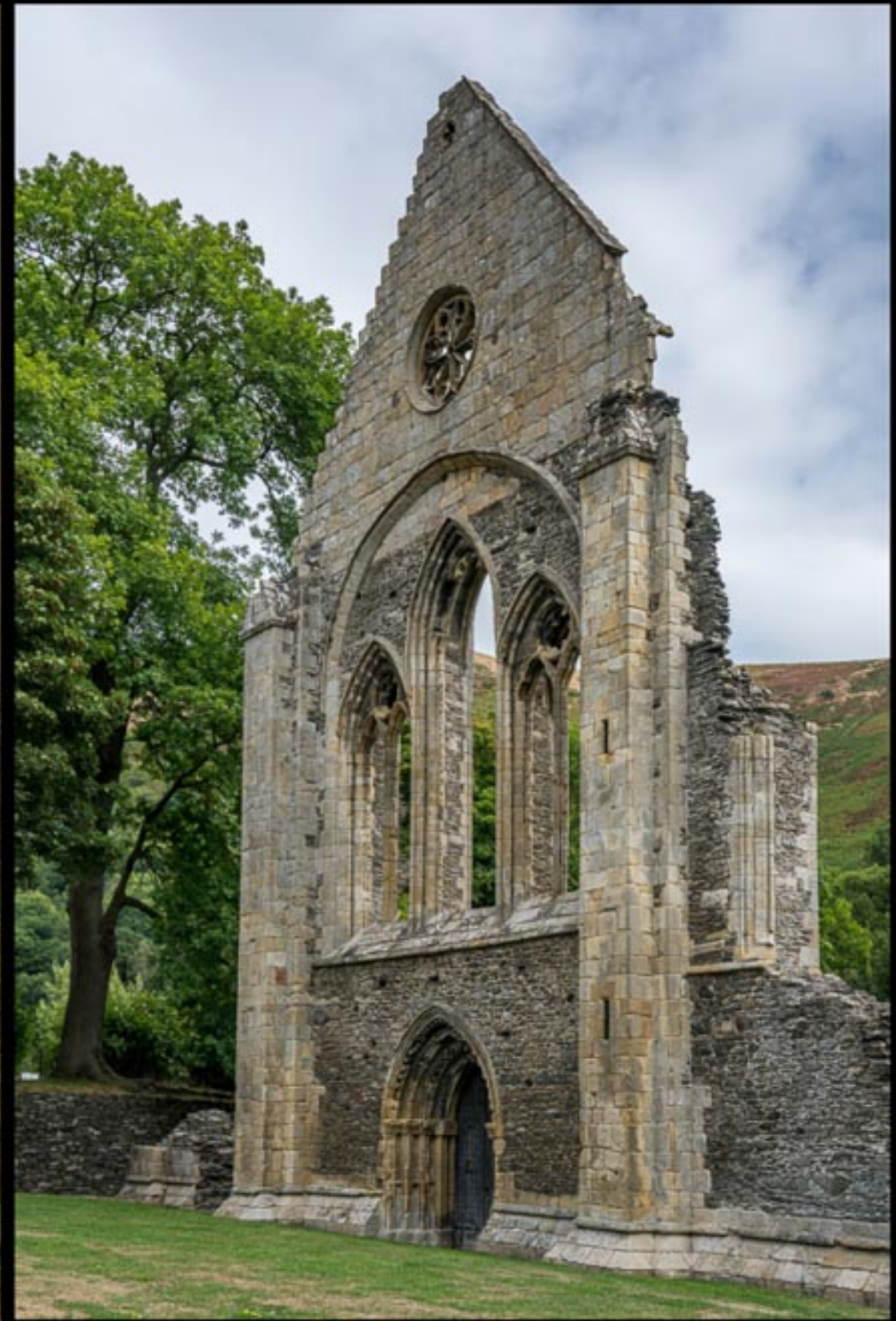
JMW Turner (1775-1851) - Valle Crucis Abbey