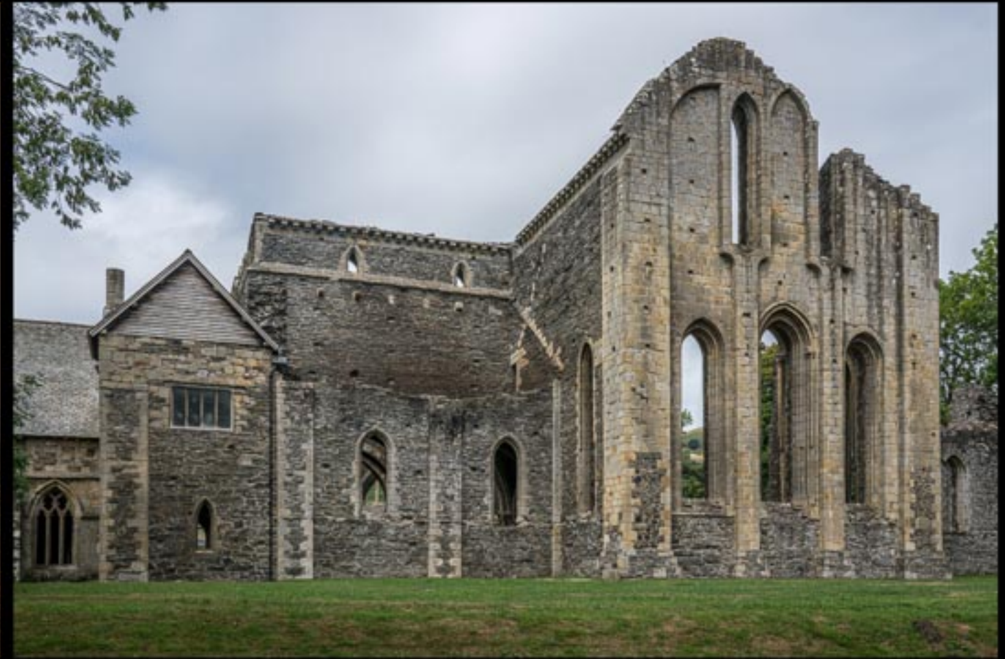
Thomas Girtin (1775-1802) - Valle Crucis Abbey